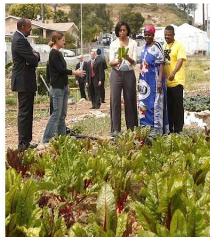
Fig. 3. - 4. Refugees working in the community garden (left) and First Lady Michelle Obama, visiting 'New Roots Community Farm', San Diego, April 15, 2010.