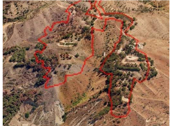
Fig.1, Intervent's area

A working group created by the partnership formed by the PAU Department, the Heritage and Landscape Superintendence of the province of Reggio Calabria, the Reggio Calabria's municipality and the Association Friends of the Earth, has prepared a draft remediation and security of one of the two nineteenth-century fortifications, commonly called "Umbertine" (the term was coined "Forti Umbertini" on site and is not recognized neither the military nor the scientific community national/international studies the nineteenth-century fortifications) (Fig. 1) on the Pentimele's Hill in Reggio Calabria, Pellizzari's Battery, the project aimed to hinder the progress of the degradation process was prompted by the state of disrepair into which the site.