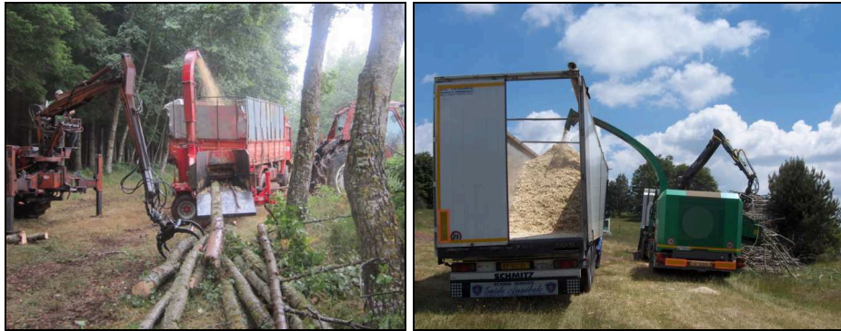
Figure 3. Biomass supply chain: different systems

The different surveys conducted during this project have a fairly critical about the development of a chain of biomass agro-forestry in the province of Reggio Calabria. In particular, the environmental and economic aspects are not always able to emerge with respect to their potential.