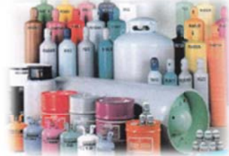
Seamless Steel Gas Cylinders