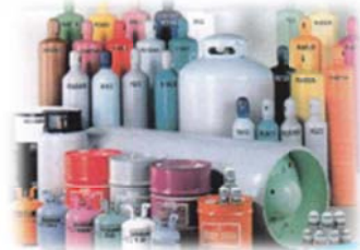
Seamless Steel Gas Cylinders